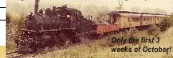
Only the first 3 weeks of October!

Come see some of the most beautiful hills in Western NY as the trees turn from their vivid greens to their vibrant reds, oranges & yellows.