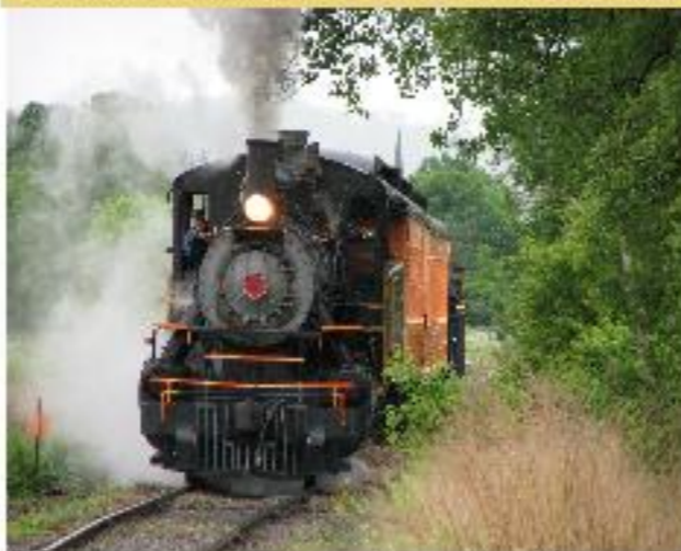
Our steam locomotive burns a low smoke soft coal. Sooty water may spray from the stack and soil clothing

We accept Master Card, Visa, Discover, cash & personal check w/ID